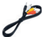
STV-250N Mini Plug to RCA Used to connect to a TV or VCR.